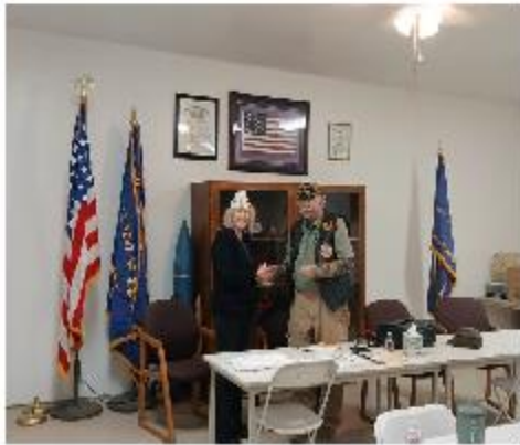
Post 15 Visit: